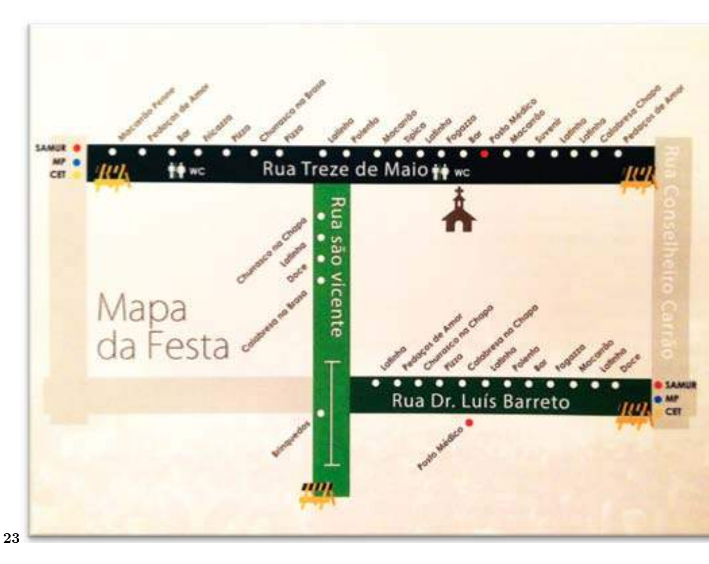
Figure 2: Figure 2: Figure 3: