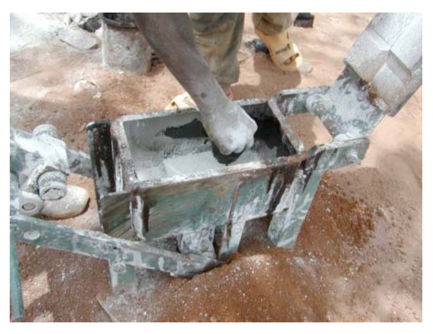
Figure 3: Source