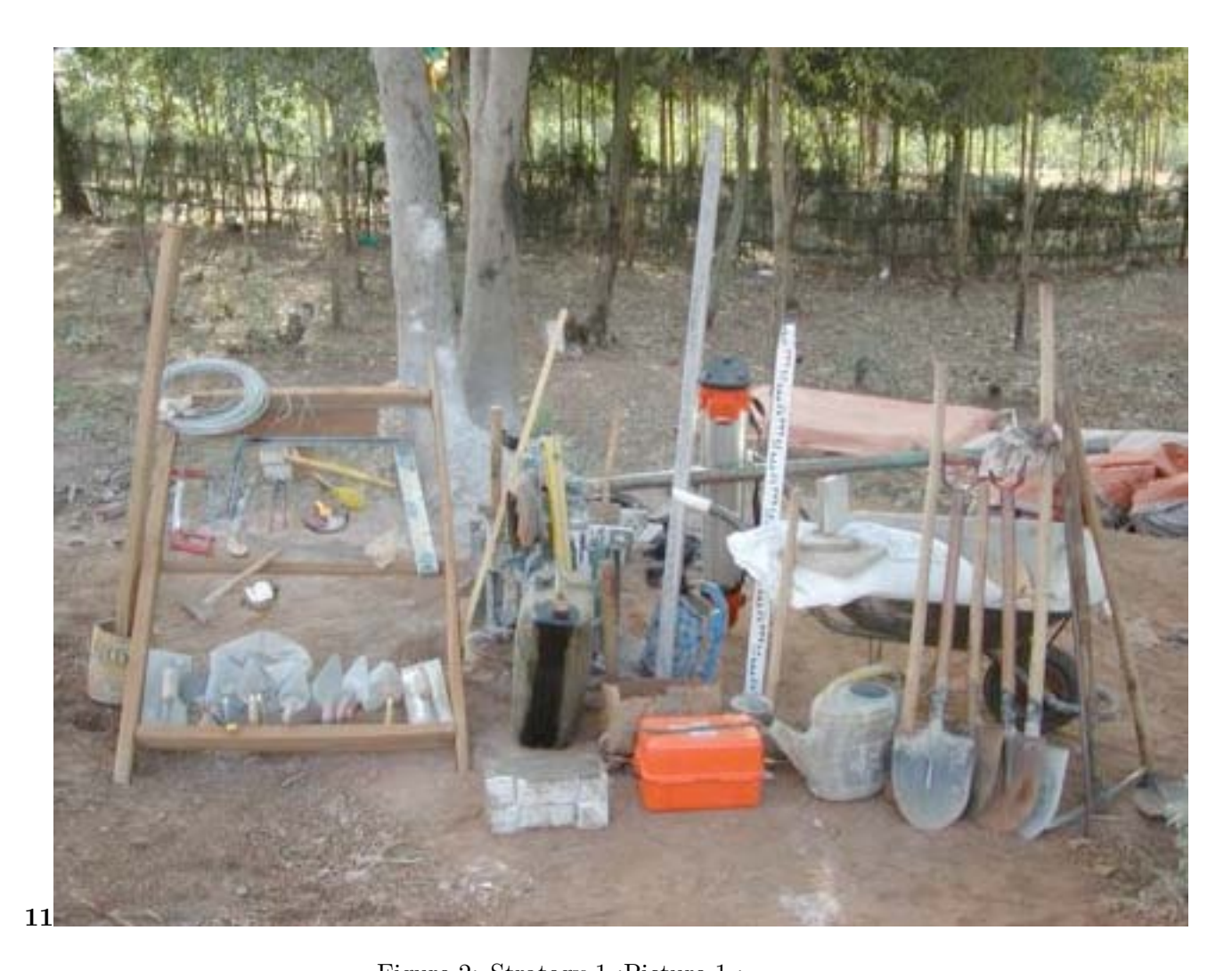
Figure 2: Strategy 1:Picture 1: