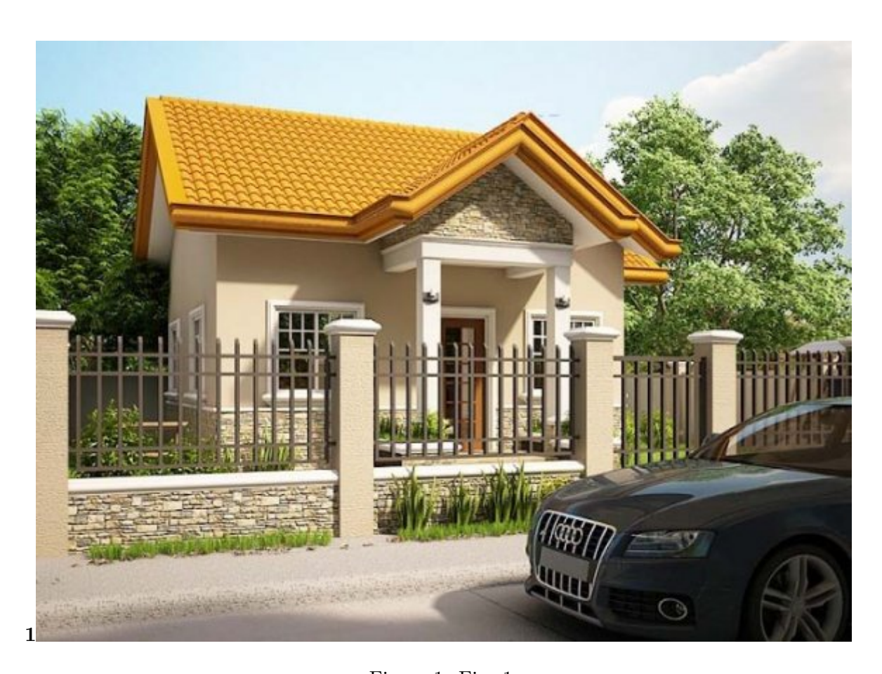
Figure 1: Fig. 1: