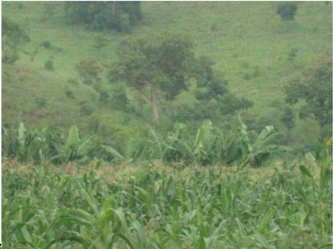
Figure 2: Figure 1