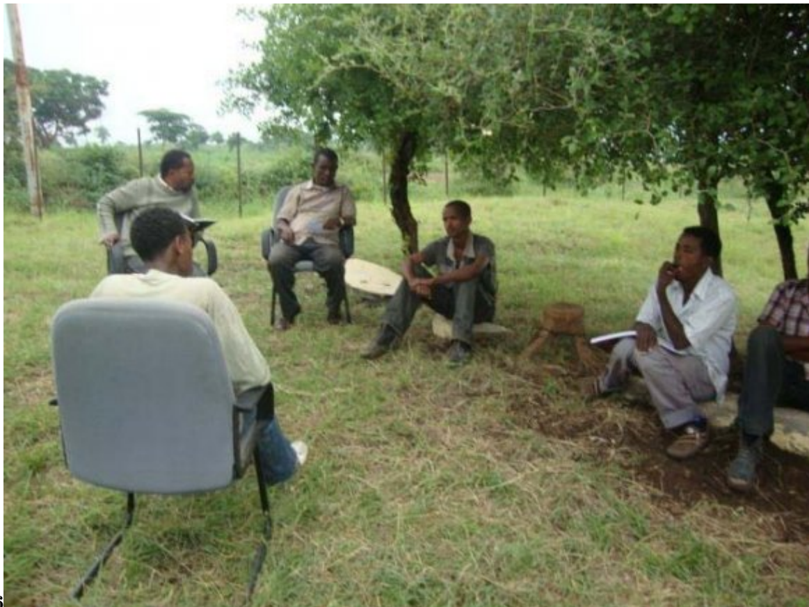
Figure 7: Figure 5 :