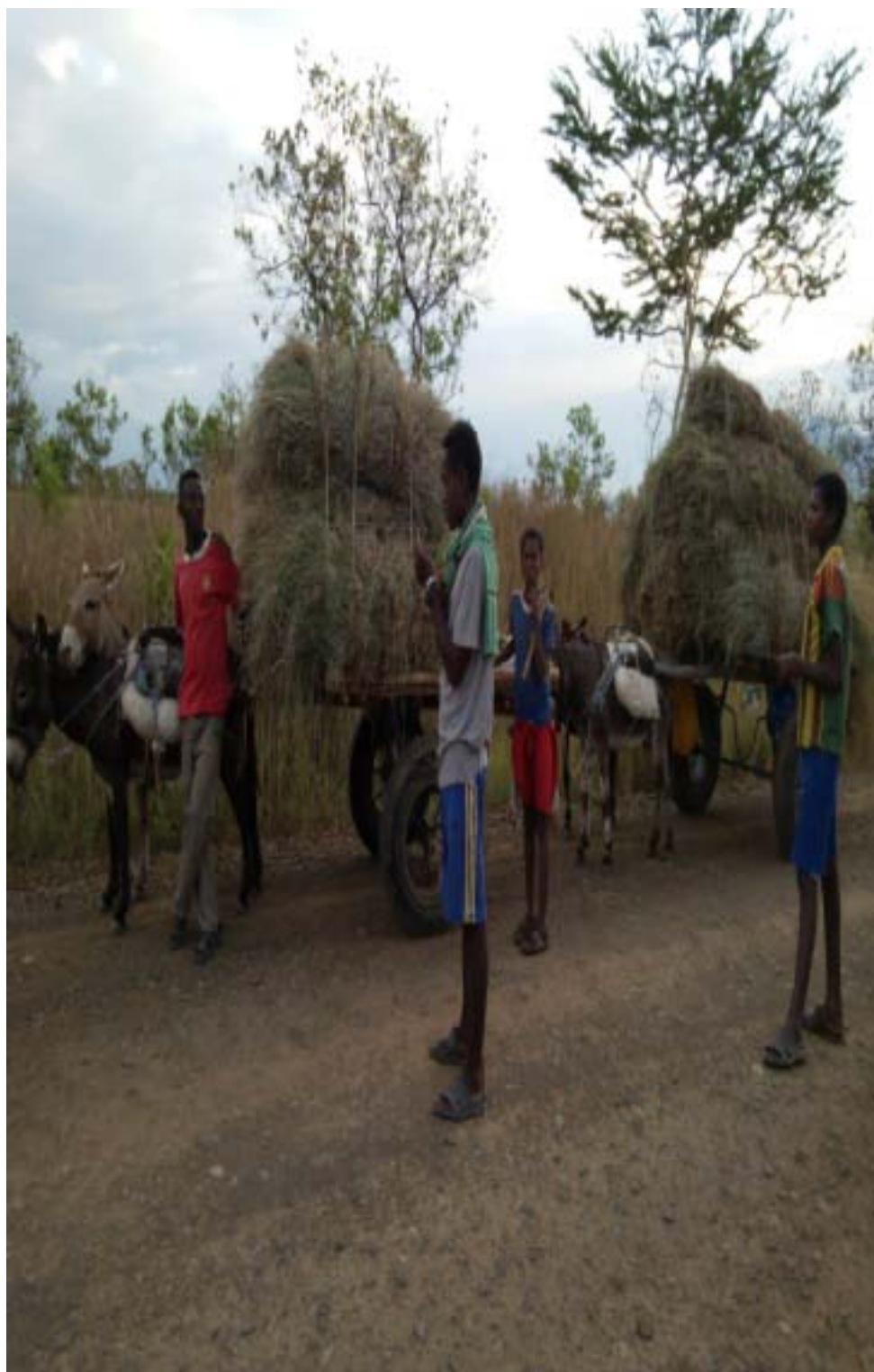
Figure 9: Focus