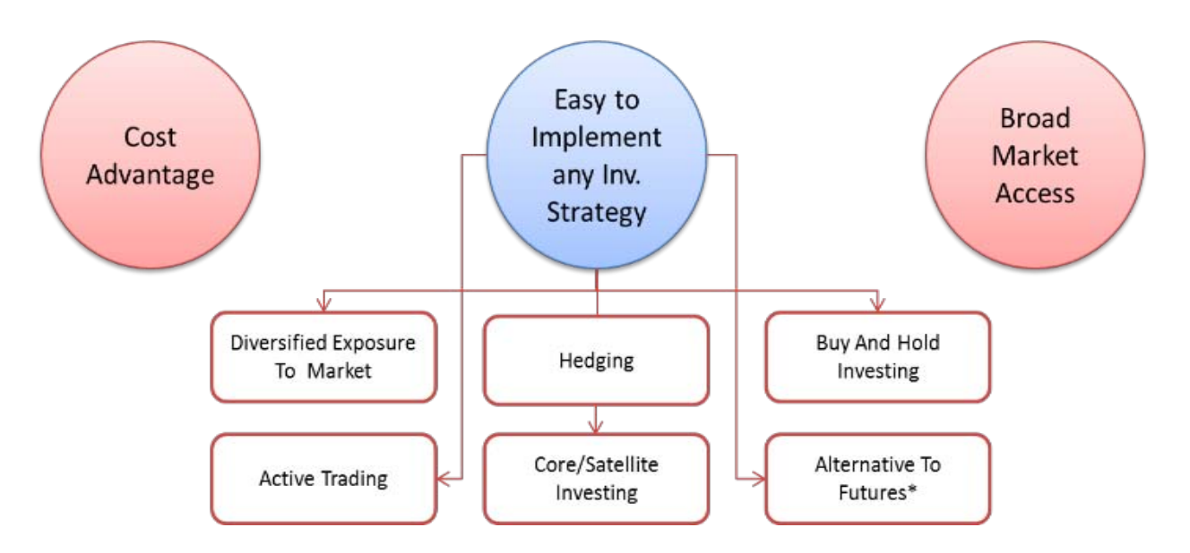
Figure 3: Key Benefits Of Etf