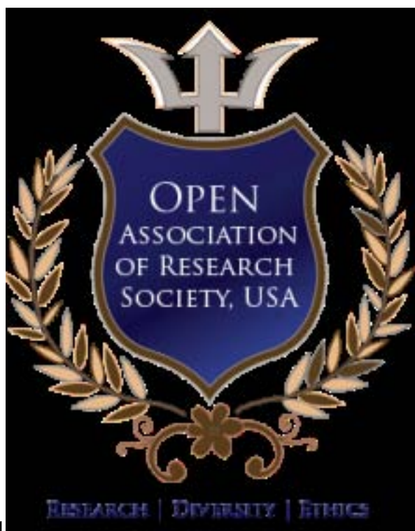
Figure 1: Fig 1 :

In recent years, public-private partnerships have been heavily promoted in the education, health, infrastructure, and community-development sectors in order to improve efficiency in the generation and There is a need for transparency and trust for mid-term review and for bilateral agreement for developing new technologies. Clear laws for transfer of technology and sabbatical provisions for scientists to work with industry need to be established. It would be appropriate to say that any partnership requires patience and trust to succeed. We are looking at the long-term benefits and it is very necessary to iron all creases at the first step itself. Regular inputs from both the parties and meetings would be an effective way to check any issue that would emerge at any stage.