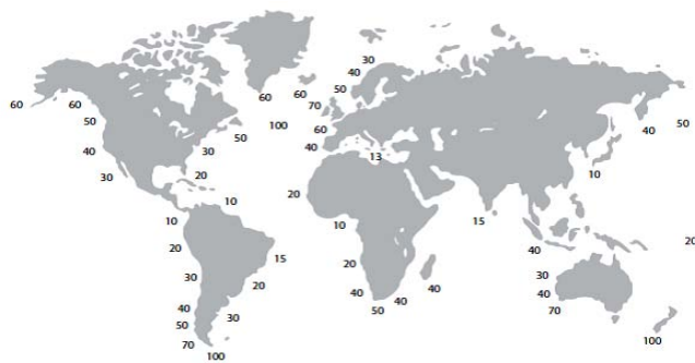
Figure 1 : The numbers on the map express the wave energy potential at the specific site – the higher the number, the greater the potential (kW/m)

The other under consideration system of energy production is an exploitation system of wave energy. The global distribution of wave power resource is expressed in the Figure 1. In this figure the wide range of wave energy statistics for the offshore data points distributed along the Atlantic and Mediterranean European coasts is illustrated and the largest potential are in east Mediterranean Sea. On the other hand a large number of concepts (over 1000 techniques) are available for wave energy conversion (WEC) [5], which have been patented in Japan, North America, and Europe. Despite this large variation in design, WEC generally can be classified by their positions (on-shore, near-shore or offshore), by their size (point absorbers, versus large absorbers) or by their operating principle.