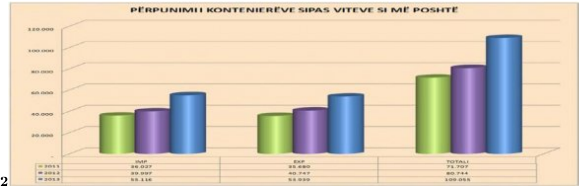
Figure 2: Figure 2 :