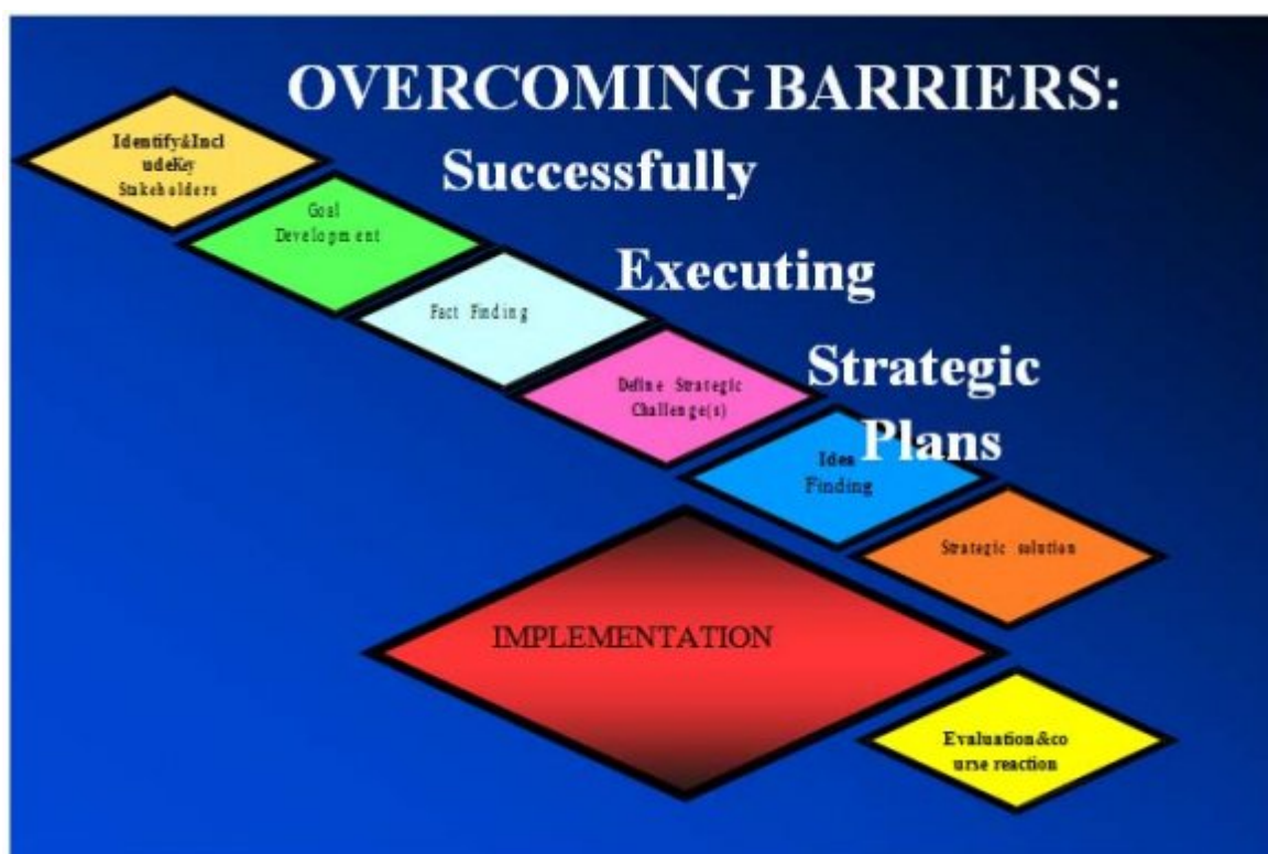
Figure 3: Volume