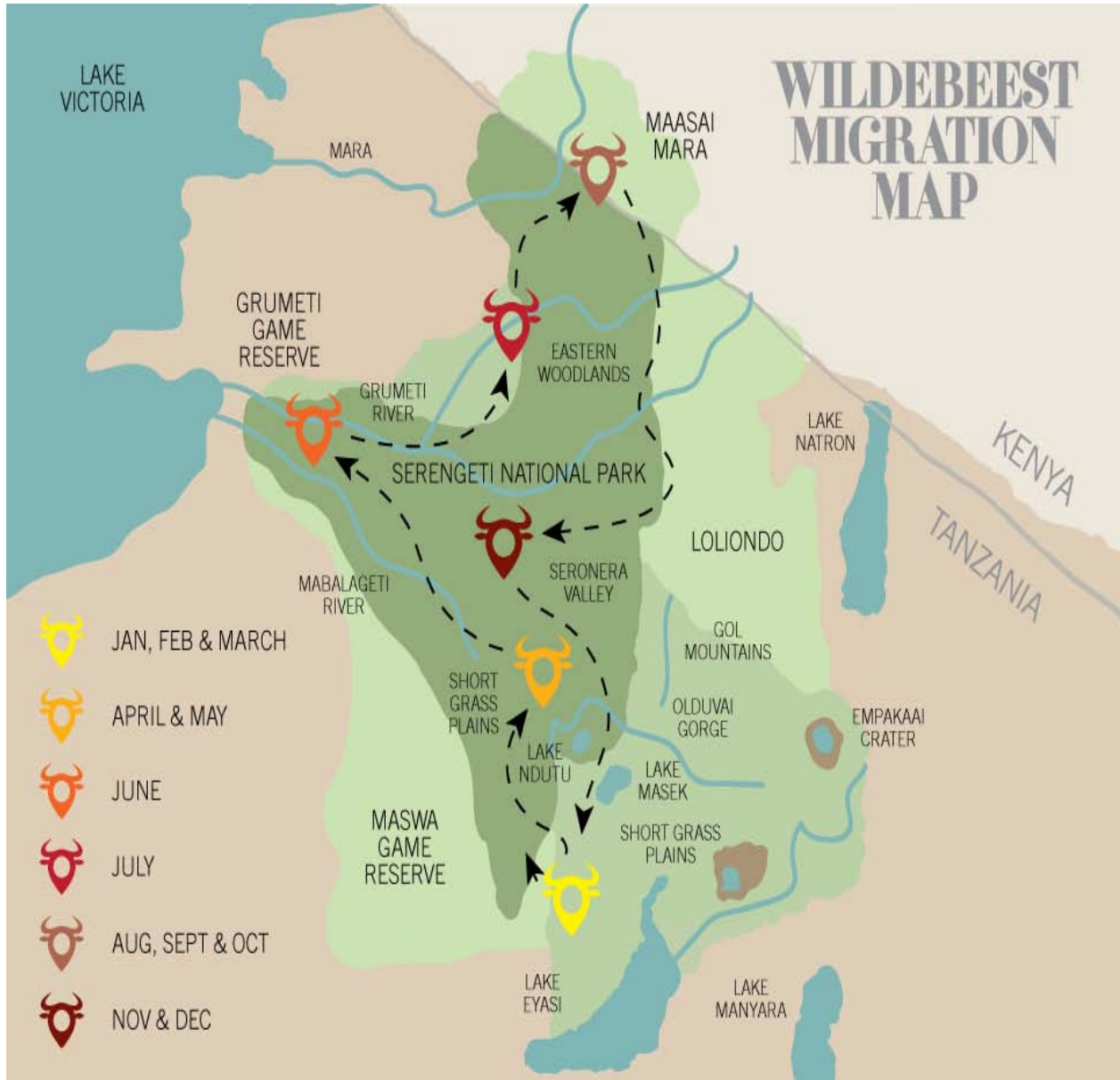
Figure 1: Migration Pattern & Timing