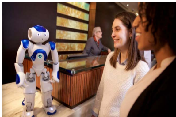
Fig. 2: Robots working as a hospitality professional.