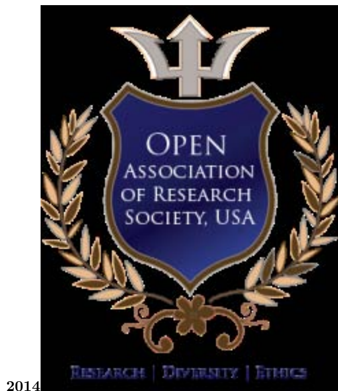
Figure 1: Year 2014 ©